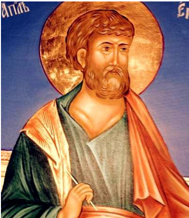
Detail of St Luke.