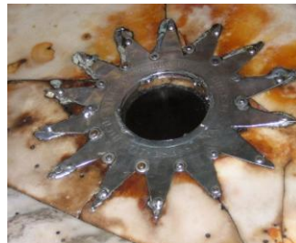
The silver star under the Altar of the Nativity marks the spot where Christ was born

Orthodox iconography is not mere decorative artwork, but a visual medium for communicating truths of our Holy Faith. Thus, although icons made by different artists will naturally differ in some respects, they are governed by certain rules and based on ancient patterns, to ensure agreement with other elements of Holy Tradition. Observe the icon of Christ’s Nativity, containing many details which could be overlooked if our veneration is too brief. Constantine Cavernos describes its elements beautifully: