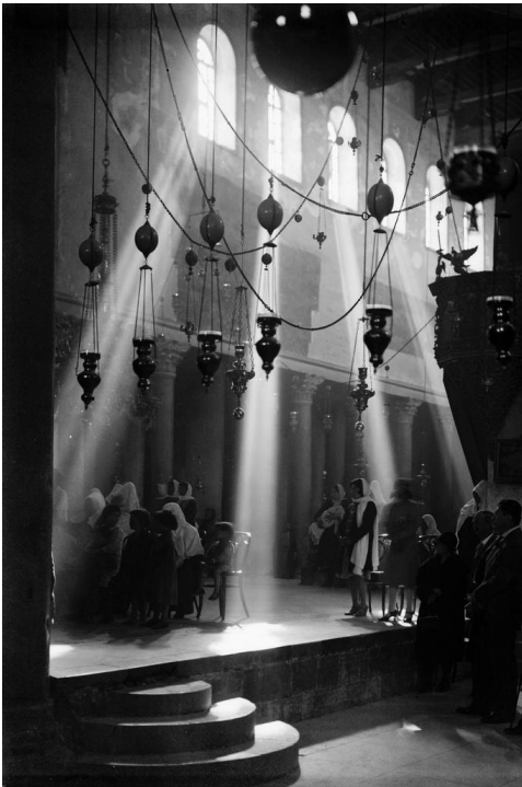
Church of the Nativity, Bethlehem